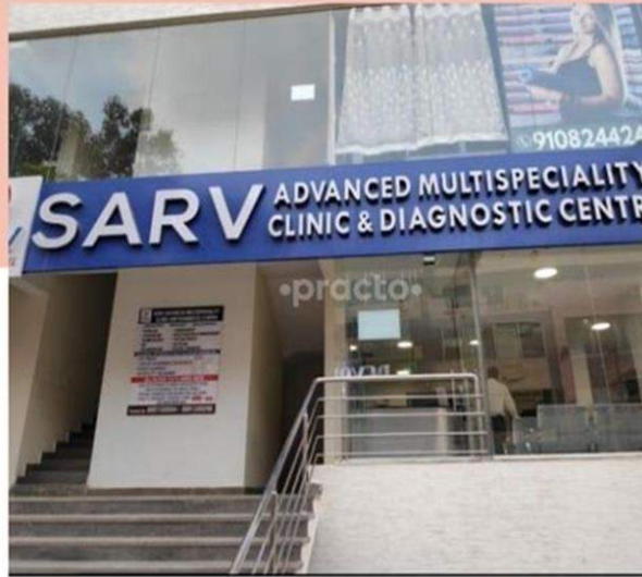
SARV MULTISPECIALITY HOSPITAL