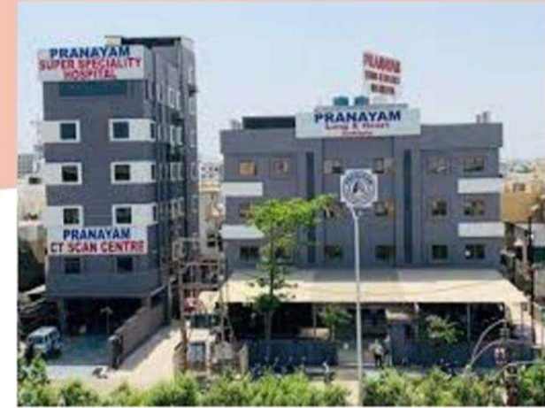
PRANAYM LUNG & HEART HOSPITAL